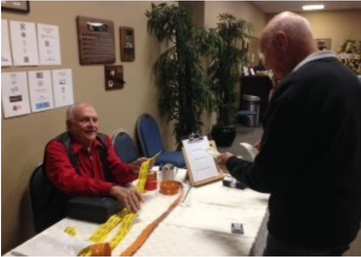
How many tickets would you like?