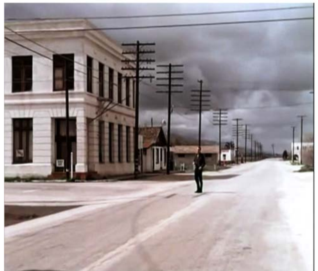
Circa 1966 – Screenshot “Beachhead”; Q.M. Productions

The scenes of Old Town Temecula, i.e., the town of “Kinney”, feature several iconic and well known landmarks in the “Beachhead” episode. These scenes include the old bank building on Front Street, the Hotel Palomar on Front Street, the “Merc” on Main Street, the Welty Hotel on Main Street, and portions of the old Murrieta Creek Bridge. All of these landmarks are shown in The Invaders episode as they existed in March 1966. Most evident in the TV series’ scenes are the lack of sidewalks, the old