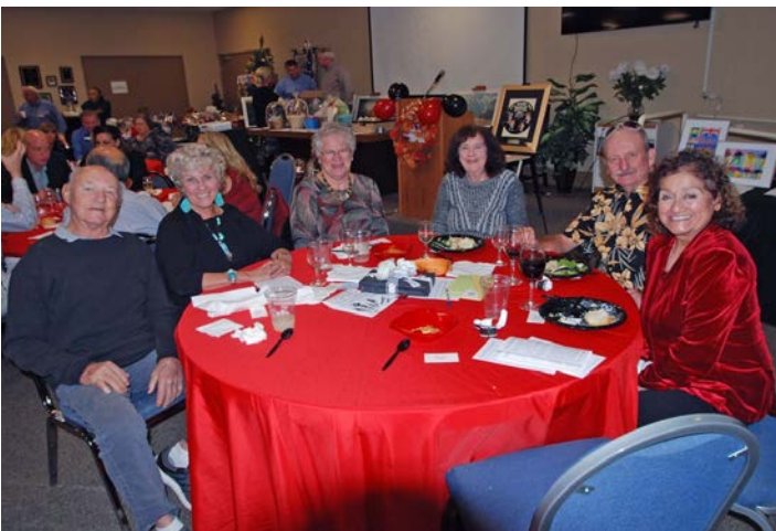
Enjoying visiting time and snacks waiting for dinner