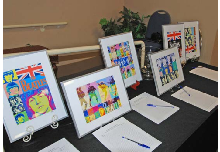
Beatles items in silent auction