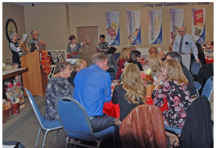
Working the raffle and auction